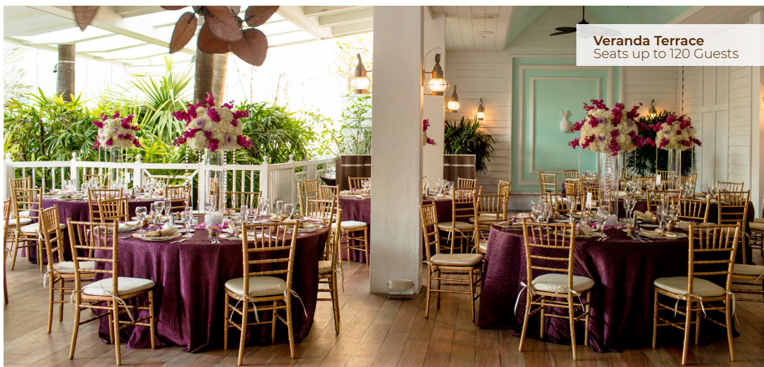
Veranda Terrace Seats up to 120 Guests