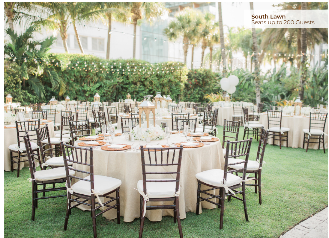
South Lawn Seats up to 200 Guests