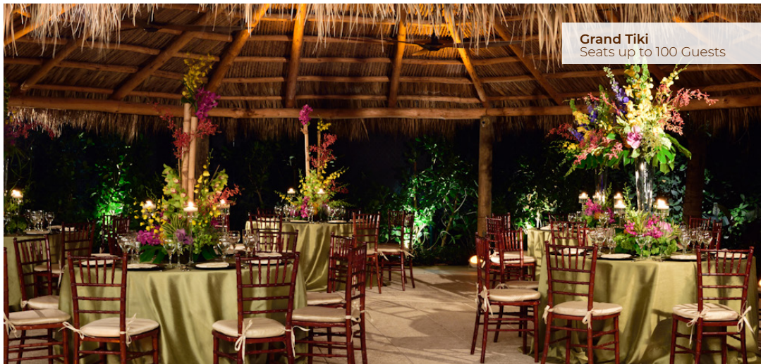
Grand Tiki Seats up to 100 Guests