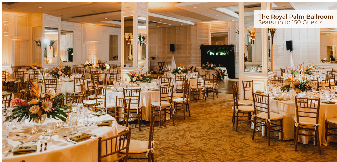
The Royal Palm Ballroom Seats up to 150 Guests