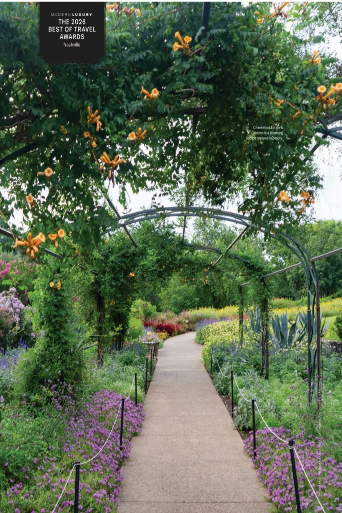
Cheekwood Estate & Gardens is a blooming escape steeped in beauty.