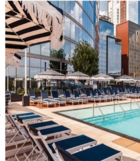
Clockwise from top left: Union Station Nashville Yard's radiant façade; the pool at JW Marriott Nashville sets the scene for waterside lounging; toast with cocktails like the Lady Marmalade at Commons Club.

Just south of Nashville in Leipers Fork, Southall Farm & Inn is a serene, design-forward retreat centered on nature and well-being. The spa is a standout, with a mineral soak overlooking the rolling hills. Culinary offerings at Sojourner and January celebrate the abundance of the farm, while Dottie's, a tucked-away speakeasy open on weekends, adds a sense of insider discovery. With trails, a pool, and immersive programming, it's a restorative weekend destination full of depth and charm. 2200 Osage Loop, Franklin, southalltn.com