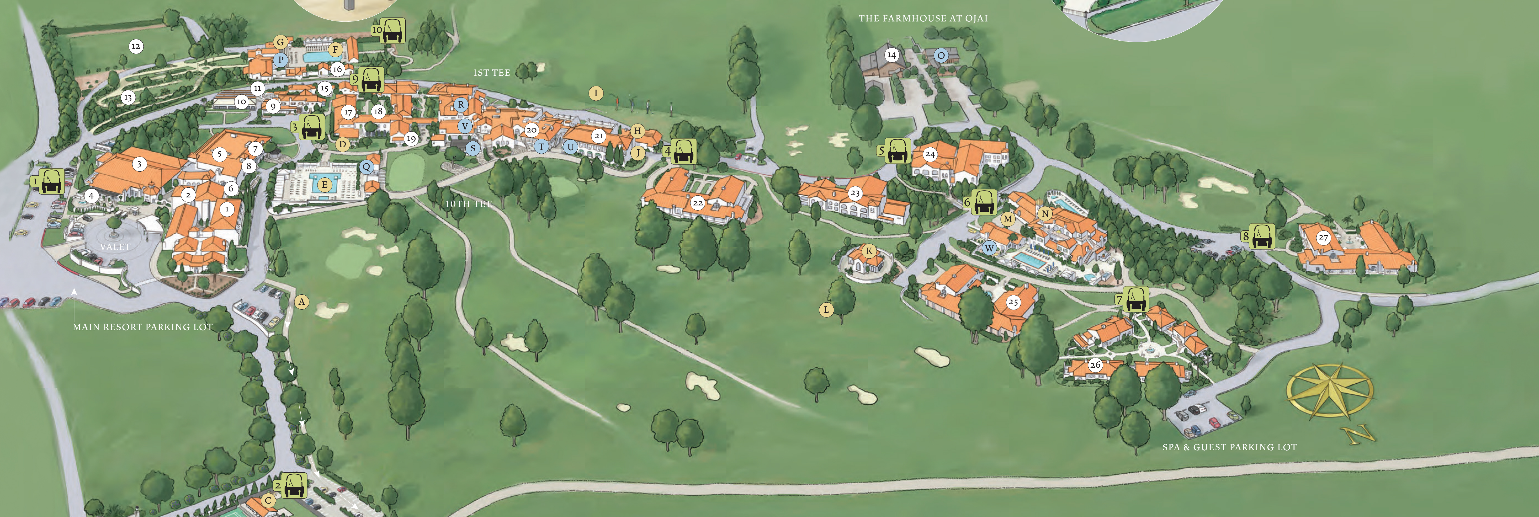
THE FARMHOUSE AT OJAI