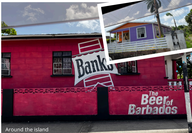
Around the island

Our visit to the Animal Flower Cave was another testament that not all beautiful Bajan scenery has to include white sand beaches. On the rugged cliffs of the north coast, the enchanting cave is a natural wonder. The cave and property are owned by the Ward Family whose lineage in Barbados traces back to 1864. The cave's unique name originates from the delicate sea anemones that dot its crystal-clear pools, resembling vibrant flowers. The intricate rock formations majestically towering over crashing waves create a mesmerizing experience. Stunning coastal views create a perfect backdrop for lunch at the onsite restaurant, where fresh fish is caught daily onsite. animalflowercave.com