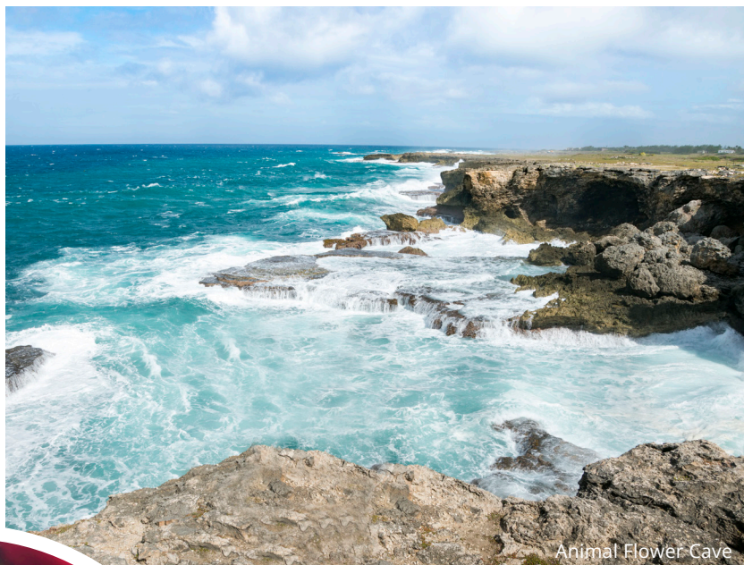
Animal Flower Cave