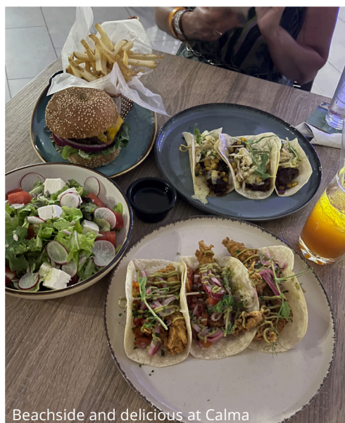
Beachside and delicious at Calma