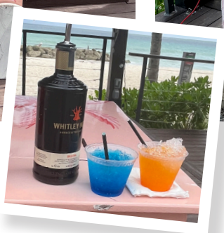
an adult take on slushies!