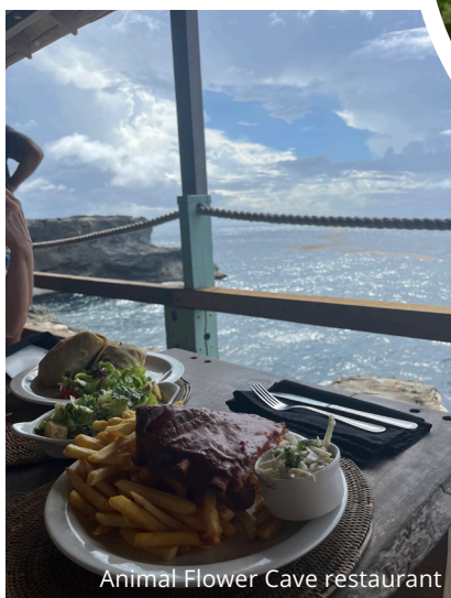
Animal Flower Cave restaurant