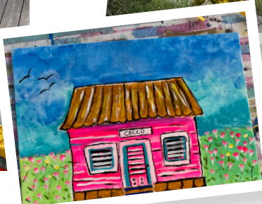
My masterpiece, inspired by the Barbados chattel houses found around the island.