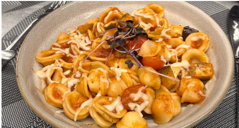
The writer's pasta dish at O2 Beach Club & Spa

A standout for an all-inclusive is the more formal dining option at Oro, which requires booking and comes with a dress code (men must wear a shirt with long or short sleeves and a collar, or a polo-style shirt, with no shorts allowed). It's worth making the effort: starters, such as burrata with grilled peach and octopus skewers are followed by well-executed mains, including lobster thermidor, red snapper and peppercorn-crusted beef fillet.