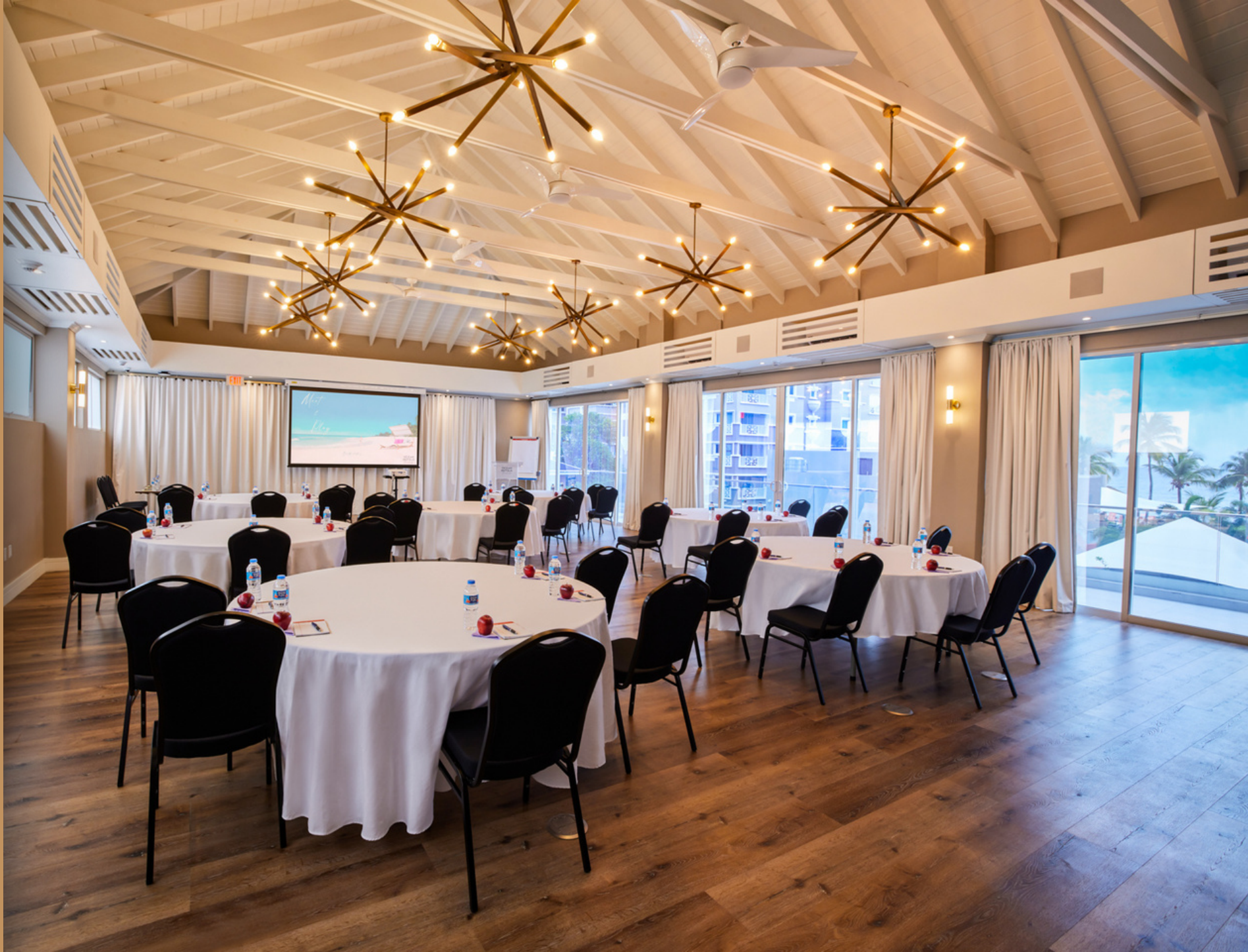
Hawksbill Meeting Room