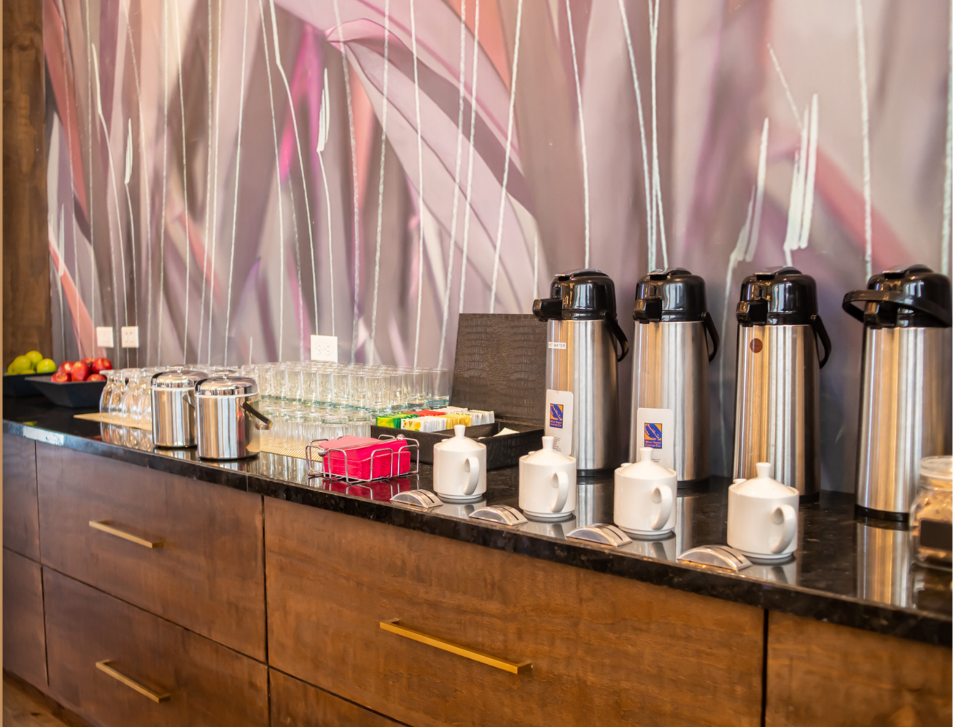
Hawksbill Meeting Room - Coffee Break