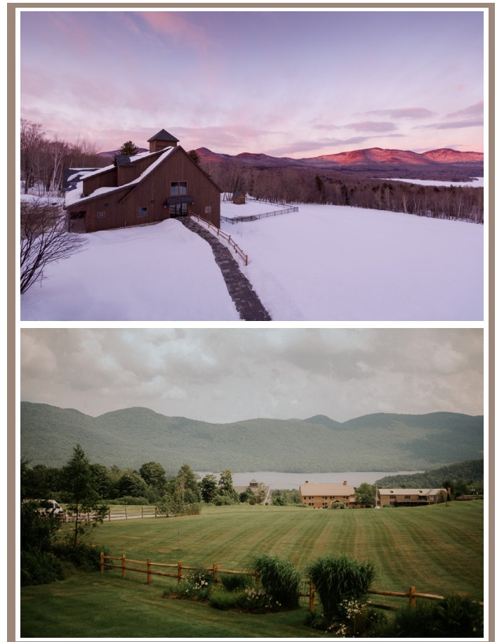
Mountain Top Resort Today. Barn Photo by Gary Hall; Main Lodge Photo by Wild and Rooted