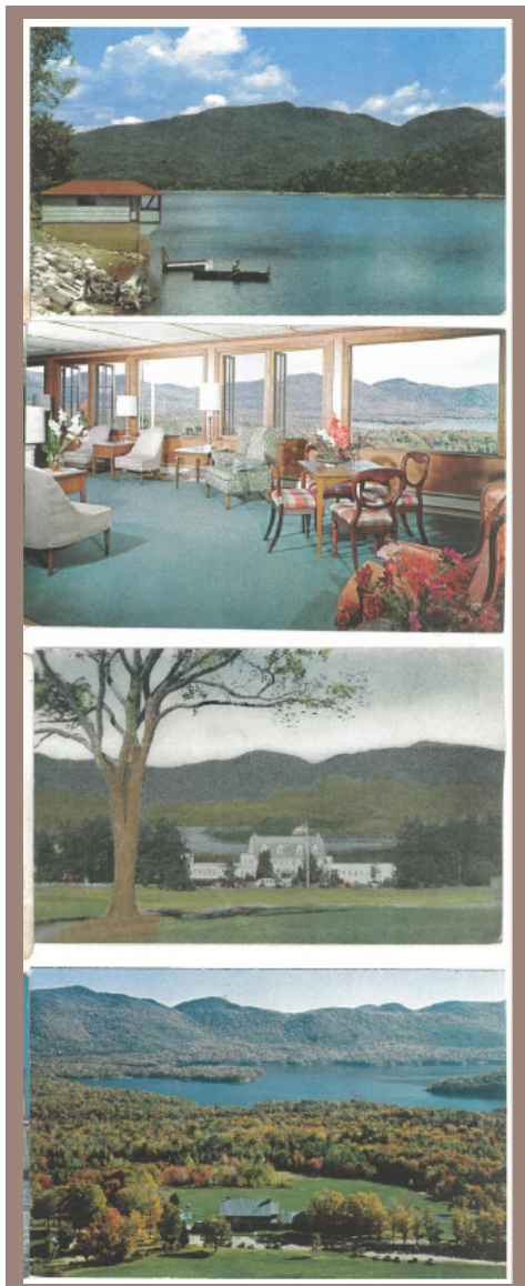
Old Mountain Top Resort Postcards

Still very much in love with the property and inspired by the desire to offer guests a year-round quintessential Vermont resort experience, Mountain Top Resort's investors and Management Team are continually implementing upgrades and have many exciting plans on the horizon.