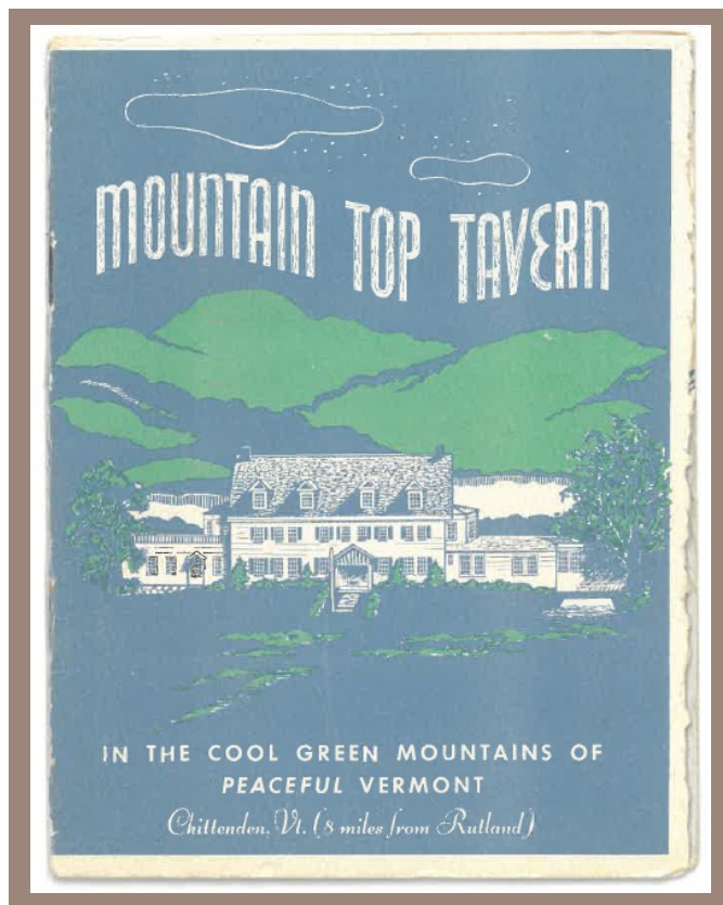
Cover of Mountain Top Tavern Booklet from 1947.

Francoise oversaw the daily operation of the Tavern and knew every inch of the then 500-acre property. Huge closets were installed in the Inn to accommodate her guests and entourages, who often came for long stays. Servants were housed on the third floor and cars were parked under the dormitory of the main building.