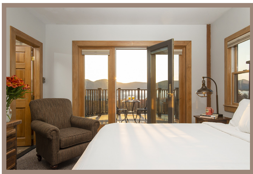
A current look into our Luxury Lodge Rooms in the Main Lodge.

In 1955, the Wolfe's were the proud hosts of President Eisenhower and his entourage during a fishing expedition. The Inn was full of governors, dignitaries, and security was tight with state troopers. No one could enter Chittenden without reason! As locals tell it, the houses on Mountain Top Road received a fresh coat of paint before the President's motorcade arrived.