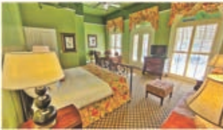
ALAMO PLAZA KING WITH BALCONY