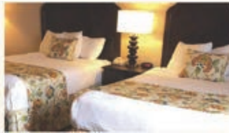
CLASSIC TWO QUEENS