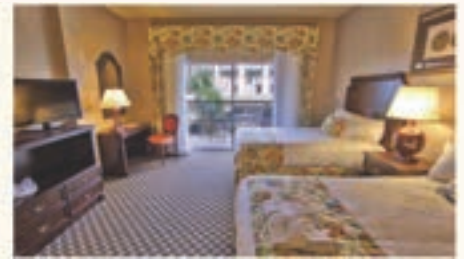
CLASSIC TWO DOUBLES WITH BALCONY