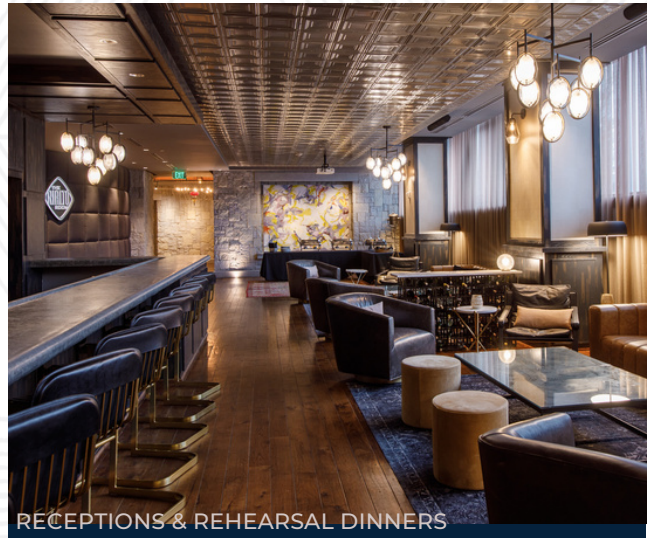
RECEPTIONS & REHEARSAL DINNERS

When you say "I do" to our inspired event spaces and luxe accommodations, you are welcoming an elevated level of hospitality and ease into your wedding planning.