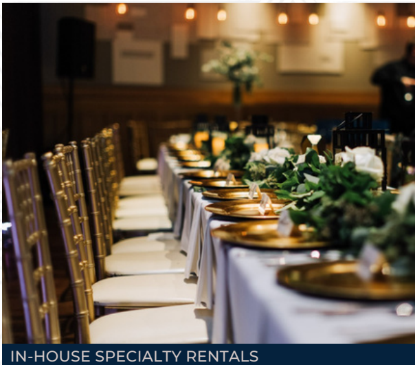
IN-HOUSE SPECIALTY RENTALS

Whether you're looking for a romantic destination for your wedding weekend, a reception at the Rialto Club, or a room block for your friends and family - we'll personalize the setting just for you.