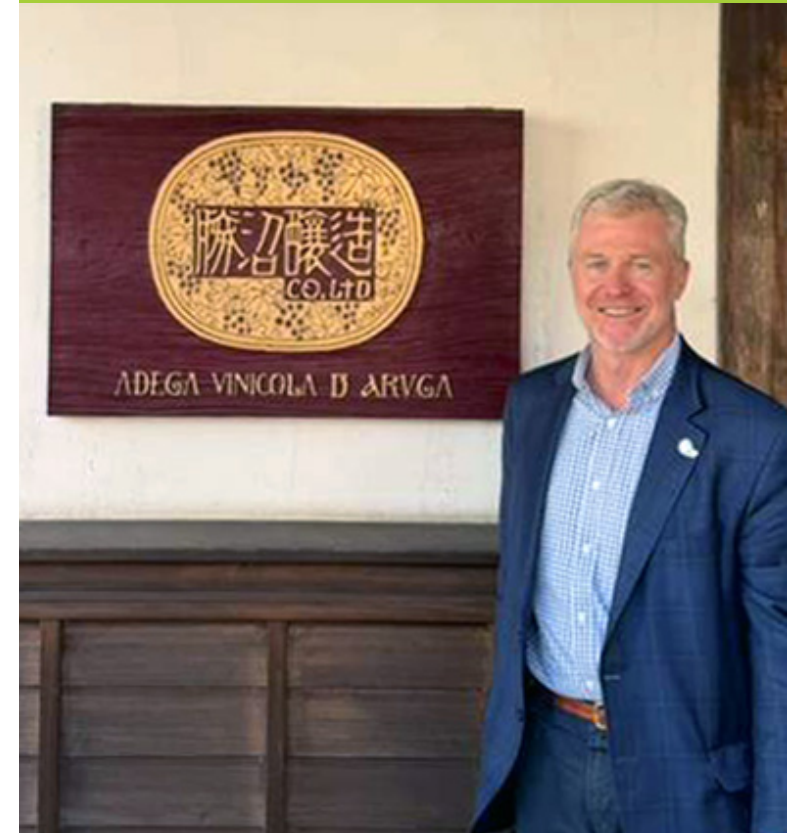
A winery visit to AdegA Vinicola D Arvga in the Yamanashi prefecture. The main grape is Koshu and there were some delicious examples the group was able to taste.