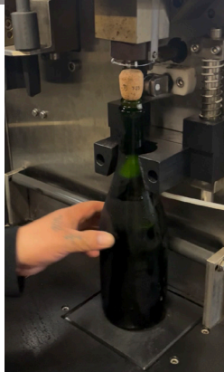
Bottling our Rosés

Fessivity is a very hands on project. After months en tirage, riddling, adding dosage, the cork is placed.