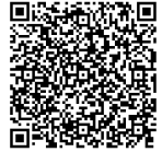
Scan for: Villa Menu