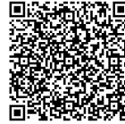
Scan for: Oasis Spa Menu

No stay at Couples Tower Isle is complete without a spa experience, especially if it's made for two. Our Oasis Spa offers a variety of services designed for couples, including side-by-side Swedish massages, seaweed wraps, and his-and-her mani-pedis in pure white treatment rooms clustered around an outdoor Buddha plunge pool.