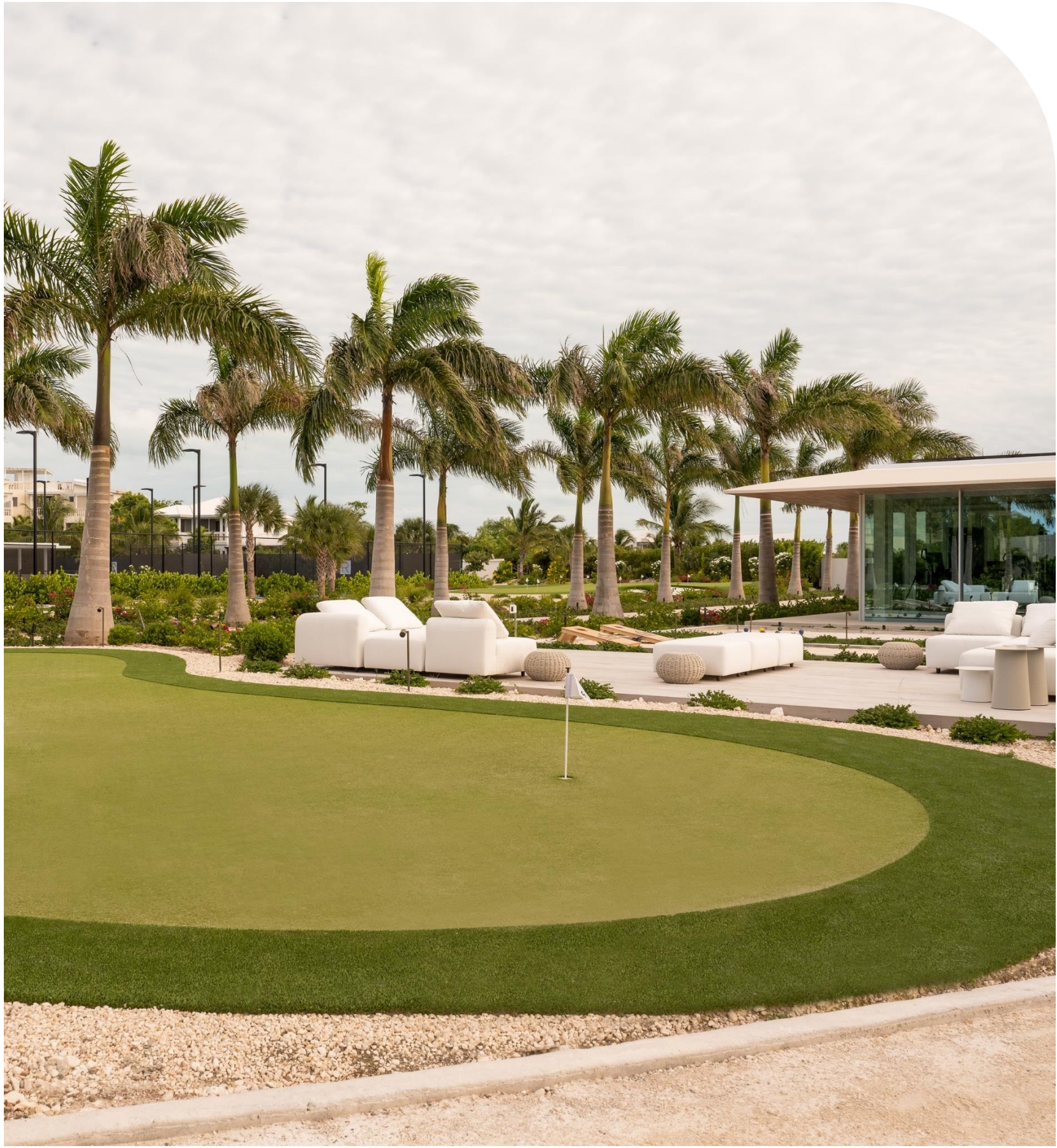
THE RESERVE GRACE BAY | BEACH ENCLAVE