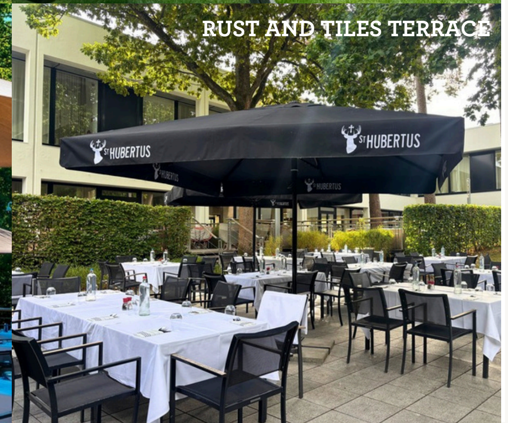
RUST AND TILES TERRACE