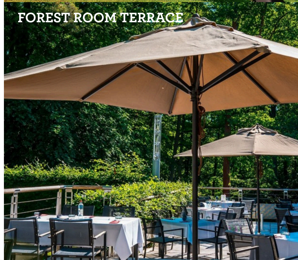
FOREST ROOM TERRACE