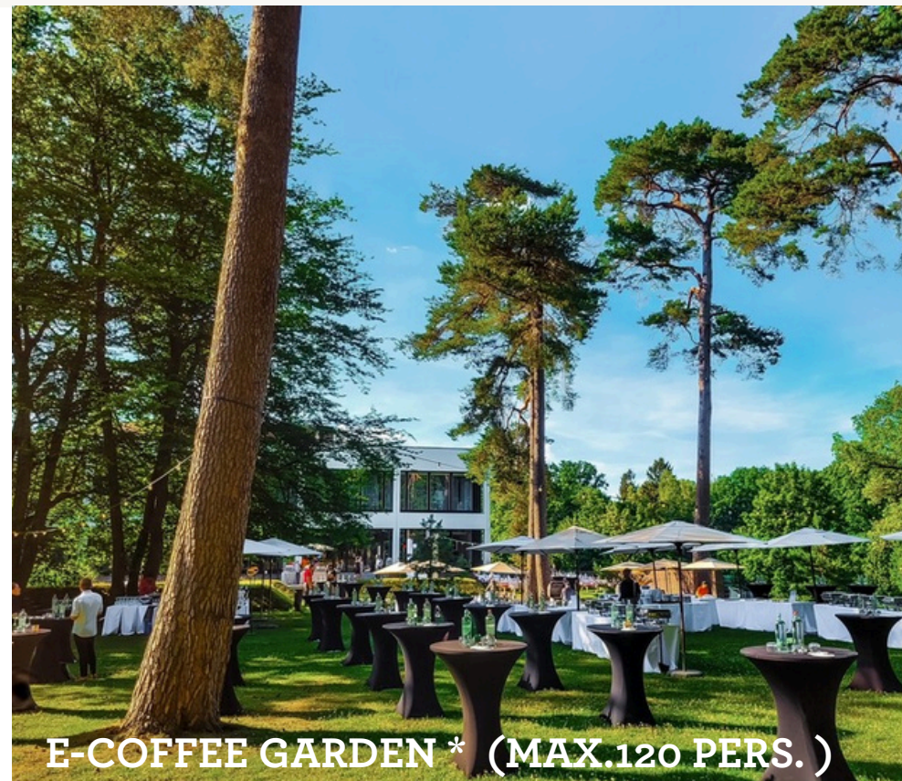
E-COFFEE GARDEN * (MAX.120 PERS.)